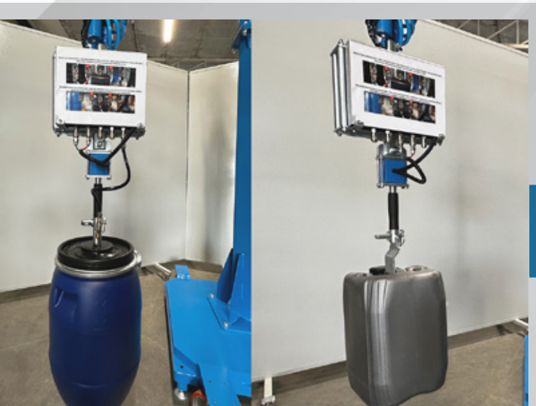
Vacful Multi Vacuum & Mechanic Gripper for pails and drums