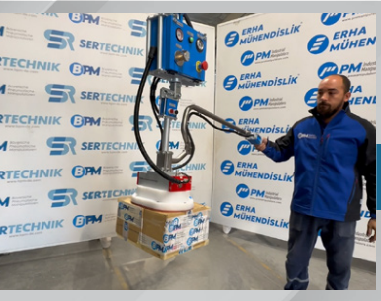
Vacful Box Vacuum Gripper for Cardboard Box