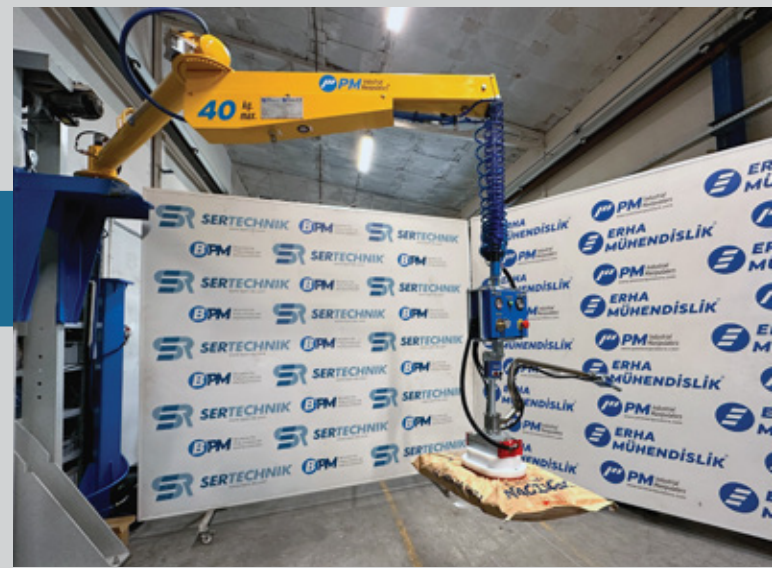
Vacful Bag Vacuum Gripper for Bags