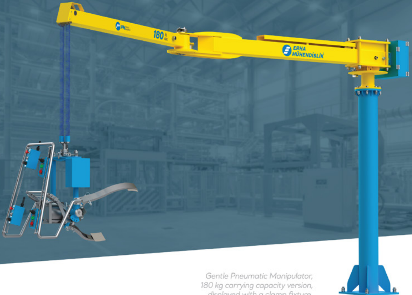
Gentle Pneumatic Manipulator, 180 kg carrying capacity version, displayed with a clamp fixture.

Gentle Pneumatic Manipulators are designed to move operator-centered loads within the work area with minimum effort. It balances the weight of the load, allowing the operator to carry the load quickly and safely.